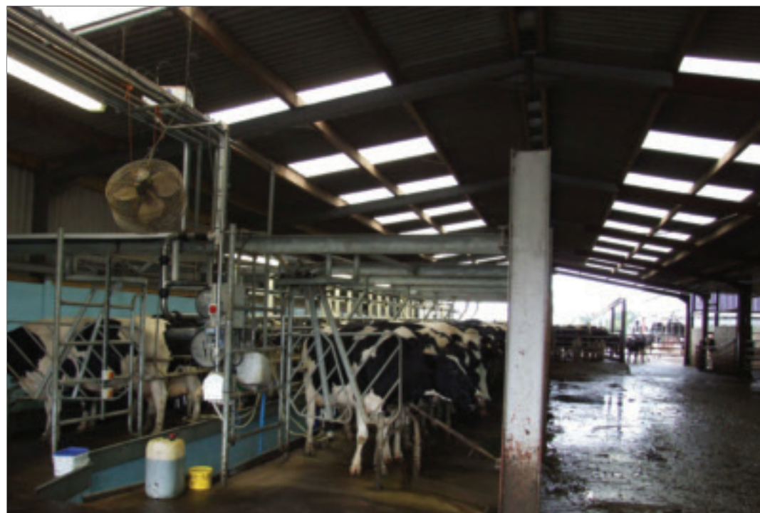
The new milking parlour in a purpose built shed has cut milking time dramatically.

He says he now has a bee in his bonnet about the potential benefits of co-operating and feeding cows. "Every farm on a TMR system has a tractor and feeder which are used two hours and then parked up for the rest of the day. There must be opportunities for squeezing more out of this kit," he adds.